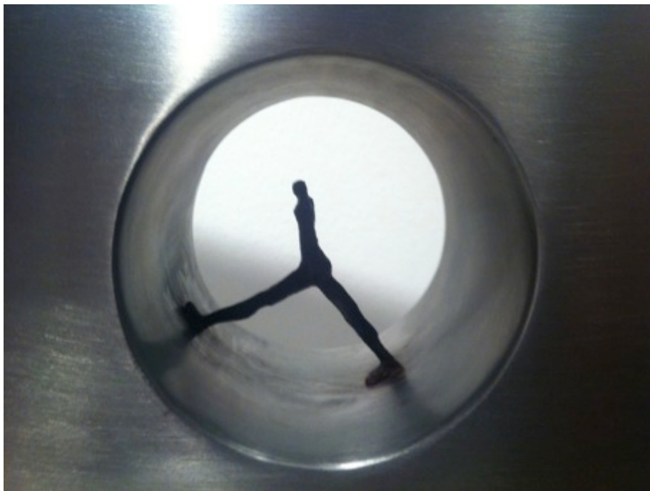
Nathalie Decoster | Concrete | Inox | 48 x 48 cm | Courtesy Avenue Des Arts Gallery

Everything contributes to giving this profoundly human oeuvre greater expressive power. The contrast between the tiny figures and the giant symbols confronting them creates a feeling of infinity.