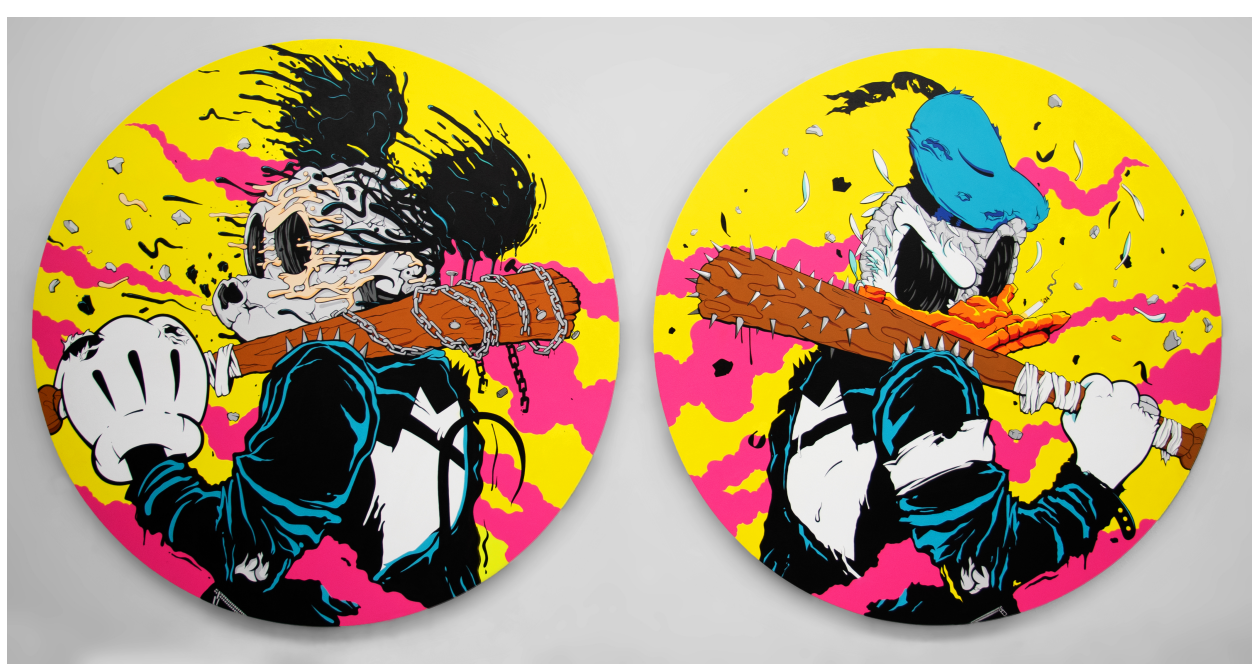
Two 5ft tondos original will be exhibited at Chin's gallery .

Avenue des Arts Gallery from Los angeles is pleased to collaborate with Chin's Gallery from Bangkog to bring to our visitors an unique experience with exclusive and limited edition releases such as brand new bronze figures, shaped wood prints, exclusive prints, signed and numbered, t-shirts, leather customs jacket, hoodies and plush toys. Some original framed drawings and canvas will be on view at the pop up too.