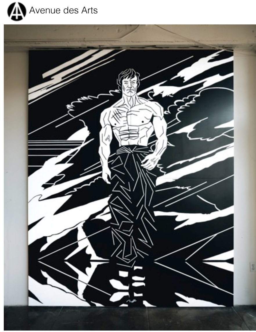
Chino, Acrylic on wood panel 8" x 10"