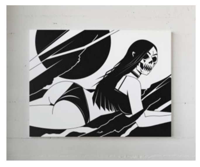
Camouflage, Acrylic on wood