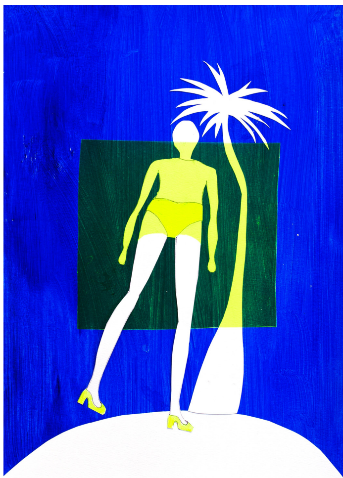
Maquette for «Palmsquare»

All the scenes are imagined and conceptualized before shooting in real locations. Once the scene is visualized in its entirety, Paradis makes sketches and paints the scene to use as a blueprint when photographing the final scene. All the costumes, accessories and sculptures are designed and prepared according to the initial vision of the scene. All the objects are meticulously designed and placed within the scene, along with Paradis herself as the central figure. Each scene is an adventure and a story in and of itself.